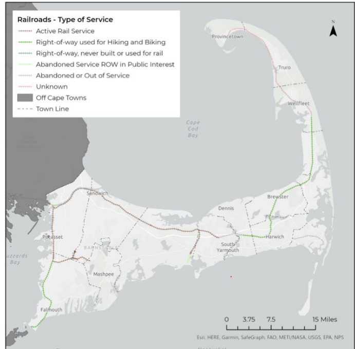
FIGURE 2. Cape Cod Rail Infrastructure

Currently, the primary use of Cape Cod's rails is for transporting solid waste by Mass Coastal Railroad. Mass Coastal is a short line freight railroad serving Cape Cod and southeastern Massachusetts between Middleboro, Joint Base Cape Cod, Hyannis, and South Yarmouth. The majority of Cape Cod's solid waste is transported to the SEMASS trash-to-energy plant in Rochester, MA via Mass