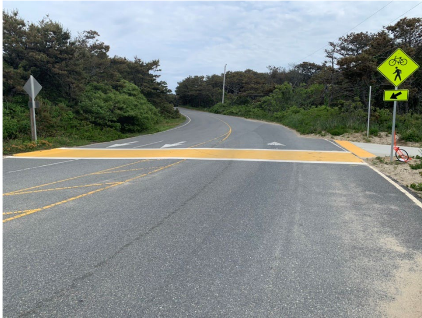
Figure 61: Road Approach