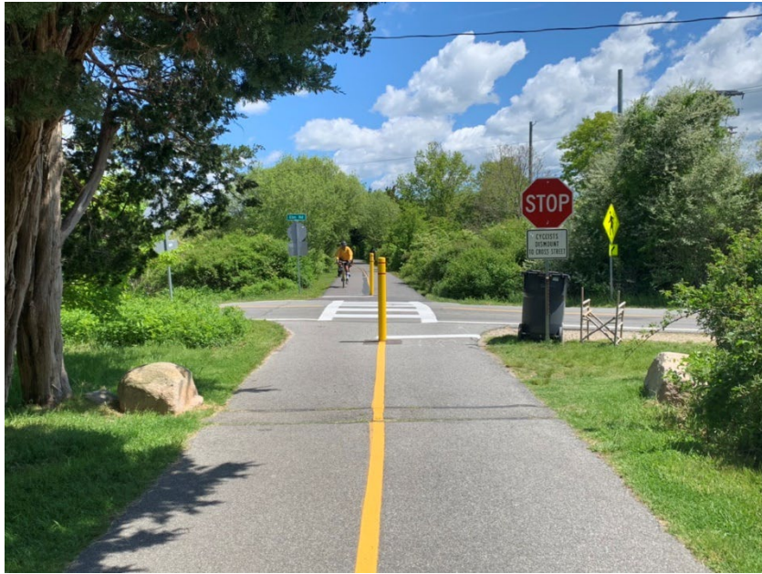
Figure 23: View of the Road Approach