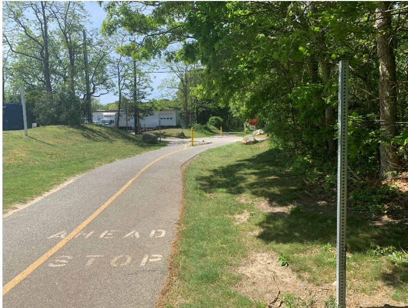
Figure 46: Pavement Markings Alerting Bicyclists to the Crossing