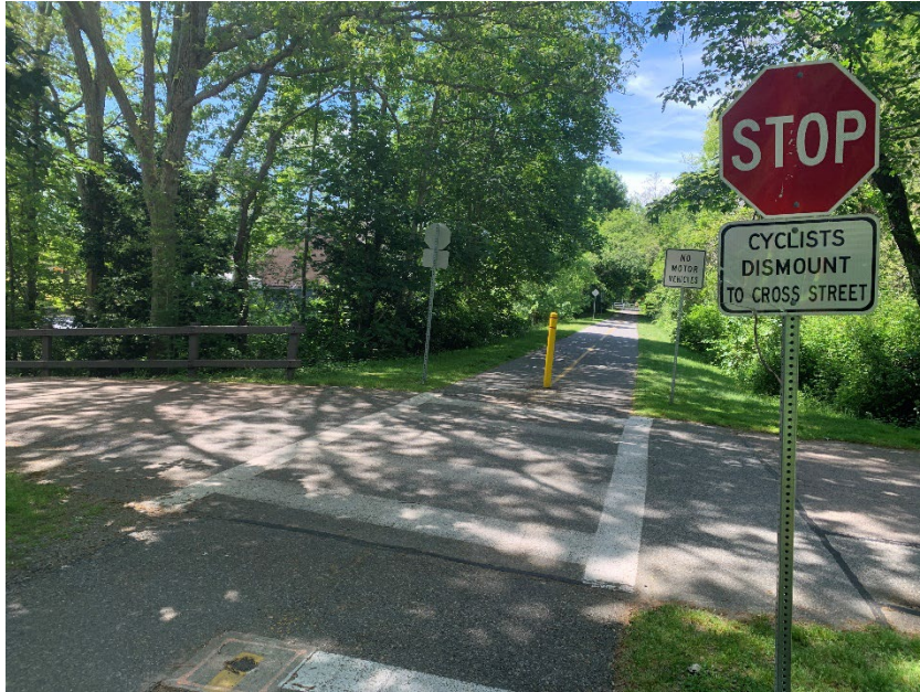
Figure 34: Cyclists Are Requested to Dismount at the Crossing