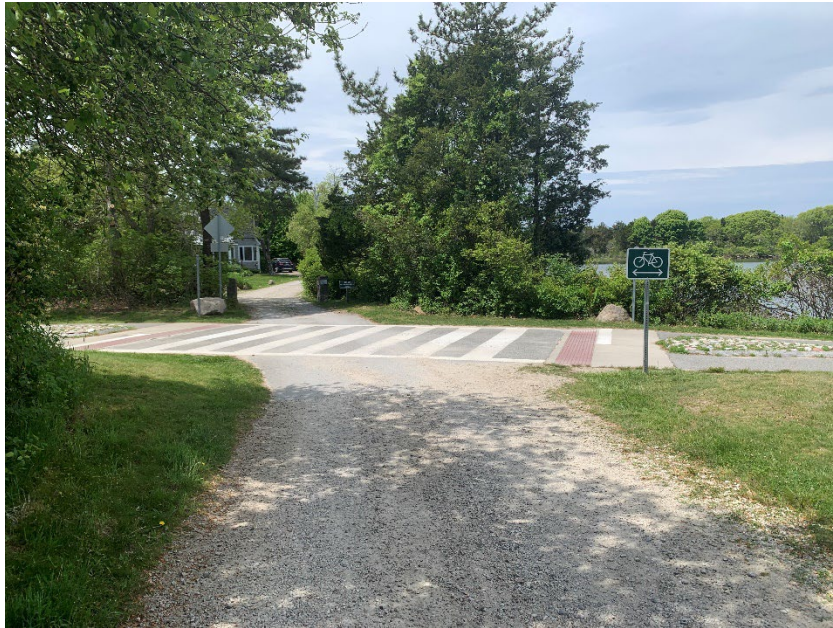
Figure 36: Road Approach Looking Toward the Shining Sea Bikeway