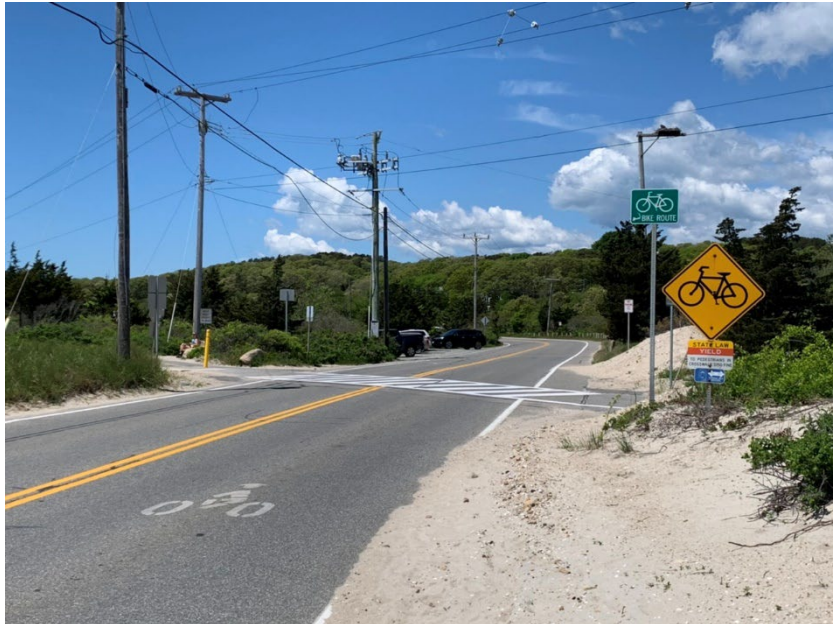
Figure 21: Westbound View of the Crossing with Bike Trail Crossing Signage and Zebra Crossing