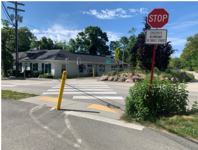
Figure 29: Cyclists Are Requested to Dismount at the Crossing