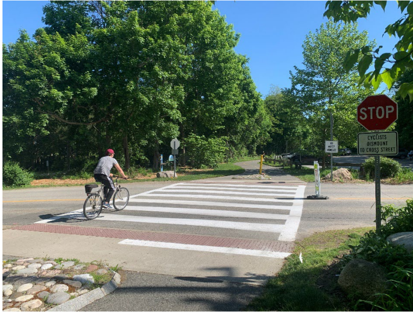
Figure 40: Ladder Crosswalk, State Law “Yield to Pedestrians” Sign Provide Good Visibility