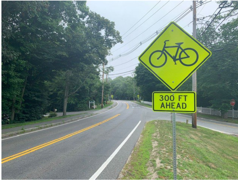
Figure 27: Fluorescent Bike Trail Ahead Sign