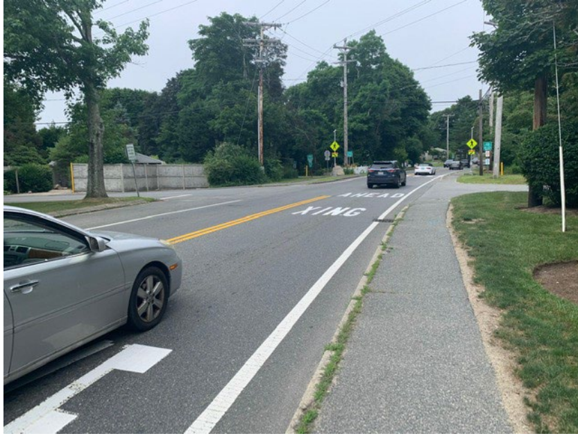
Figure 25: High Quality Pavement Markings on the Road Approach