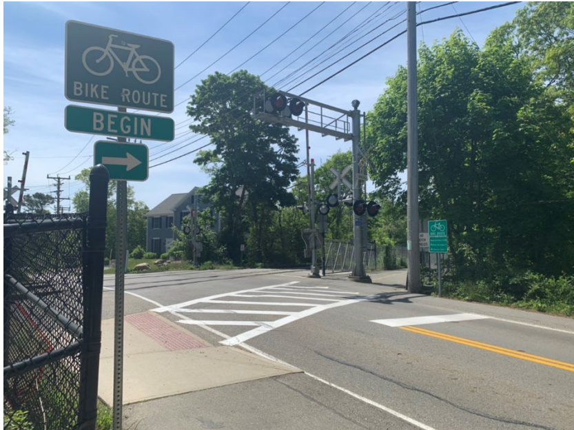
Figure 48: The Presence of the Rail Crossing can Decrease Visibility at Intersection). Zebra Crosswalk Helps Highlight Intersection Users