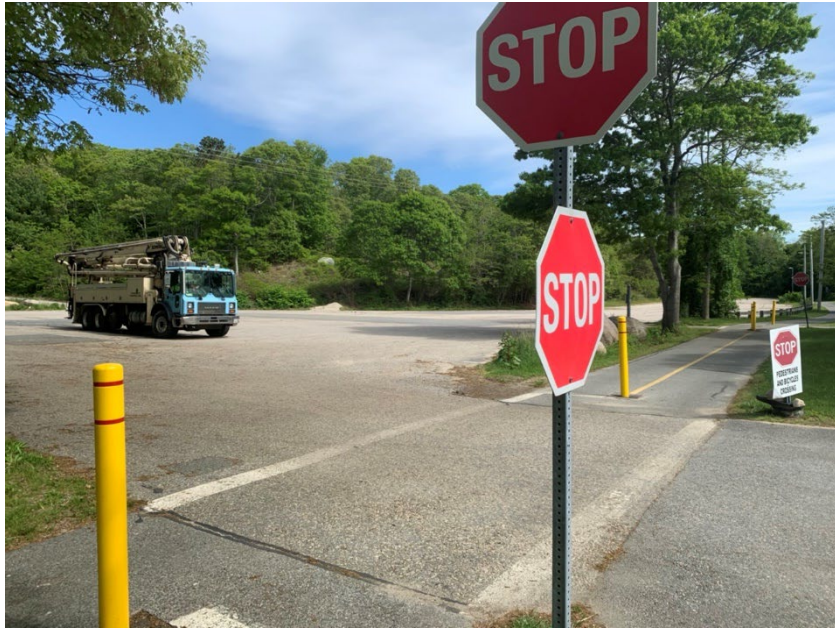
Figure 31: Road Traffic is STOP-Controlled, as is Eastbound Trail Traffic