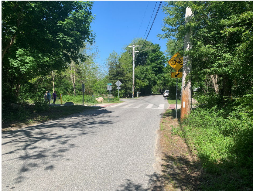
Figure 44: Bike Trail Crossing Signs Could be Partially Obscured by Telephone Poles and Foliage (Depending on Approach Angle)