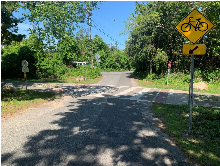
Figure 42: Highly Visible Bike Trail Crossing Signs and a Ladder Crosswalk