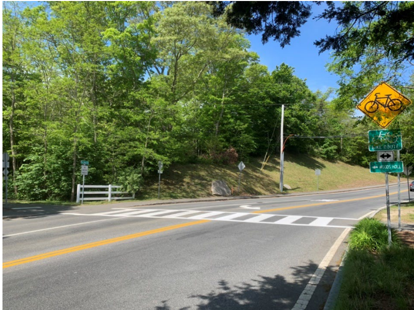
Figure 32: Road Approach to the Shining Sea Path with Bike Trail Crossing Signage