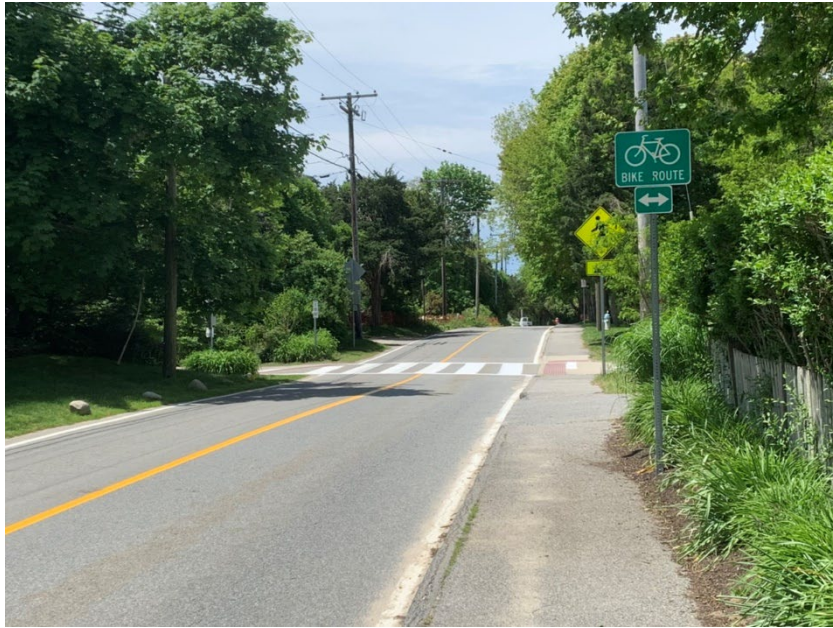
Figure 38: Bike Trail Crossing Sign Indicating Crossing Area (with Wayfinding)