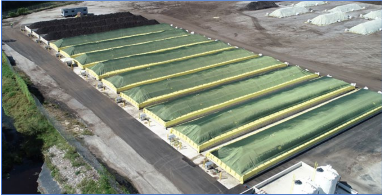
Figure 3-2: Large CASP Facility in Operation in Prince George's County, Maryland