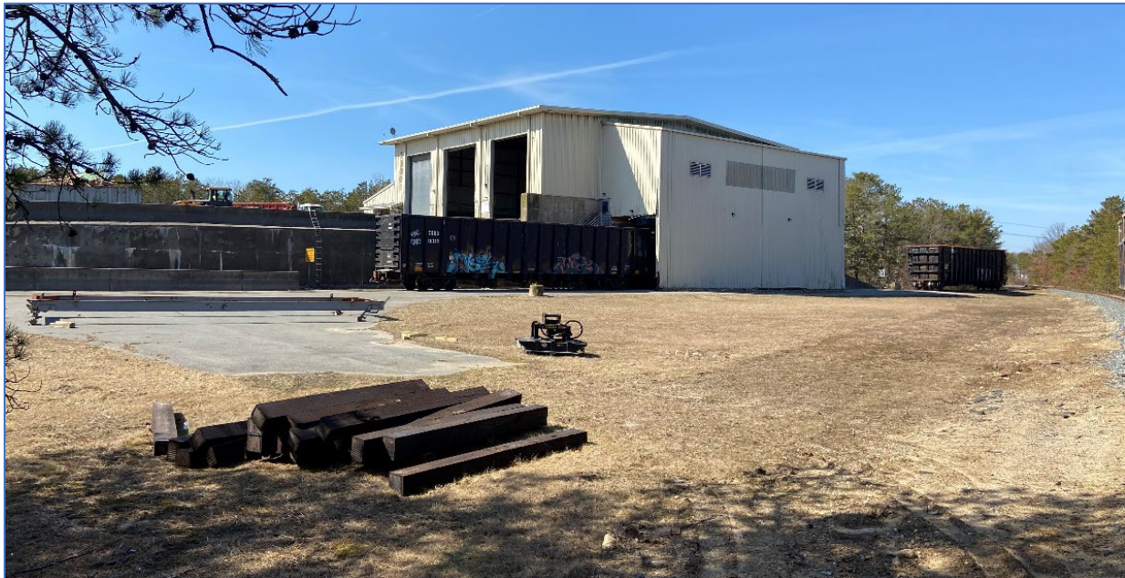
Figure 4-2: Upper Cape Regional Transfer Station

The existing UCRTS is located on JBCC and is currently operated under contract by Cavossa Disposal as a waste by rail facility that ships C&D debris to out-of-state landfills using gondola cars. Once filled, a lid is placed to cover the cars before shipment. The facility manages waste that is collected by private haulers on Cape Cod. Current throughput at the facility averages less than 100 TPD, although the permitted capacity of the facility is 89,100 TPY. The facility has three unloading bays and a total tipping floor area of approximately 6,000 SF with a reinforced push wall that is approximately 10 feet in height on one side of the building. The facility has a single loading bay for railcars. A photo of UCRTS is provided in Figure 4-2 below.