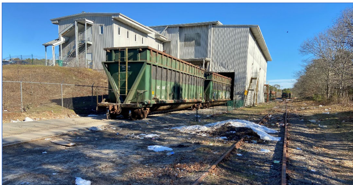
Figure 4-1: Yarmouth Transfer Station

The existing YTS is currently operated under contract by Covanta as a waste by rail facility that ships MSW to SEMASS using gondola cars. Once filled, a lid is placed to cover the cars before shipment. The facility manages waste that is collected by private haulers from Brewster, Dennis, Yarmouth, and other sources on Cape Cod. Current throughput is approximately 500 TPD, with a permitted limit of 530 TPD. The facility has six unloading bays and a total tipping floor area of approximately 7,000 square feet (SF) with concrete push walls approximately 15 feet tall on either side of the loading bays. This arrangement allows for the loading of two rail cars simultaneously and provides temporary storage capacity on the tipping floor to manage surges in waste receipts or temporary delays in loading out railcars. A photo of YTS is provided in Figure 4-1 below.