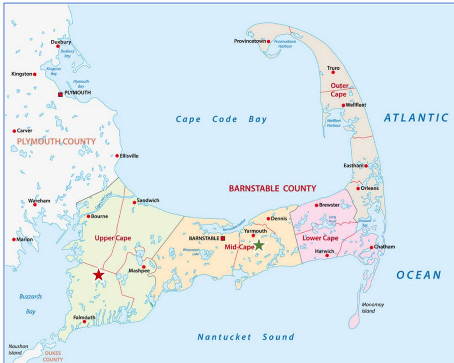
Figure 5-1: Approximate Locations of On-Cape Transfer Stations

Assuming the average collection vehicle contains ten tons of waste (a conservative assumption, as many towns will likely continue to use larger 20-ton tractor trailers to haul waste to transfer stations), the approximate annual waste tonnage and annual truckloads for each sub-region and island are listed in Table 5-1 below.