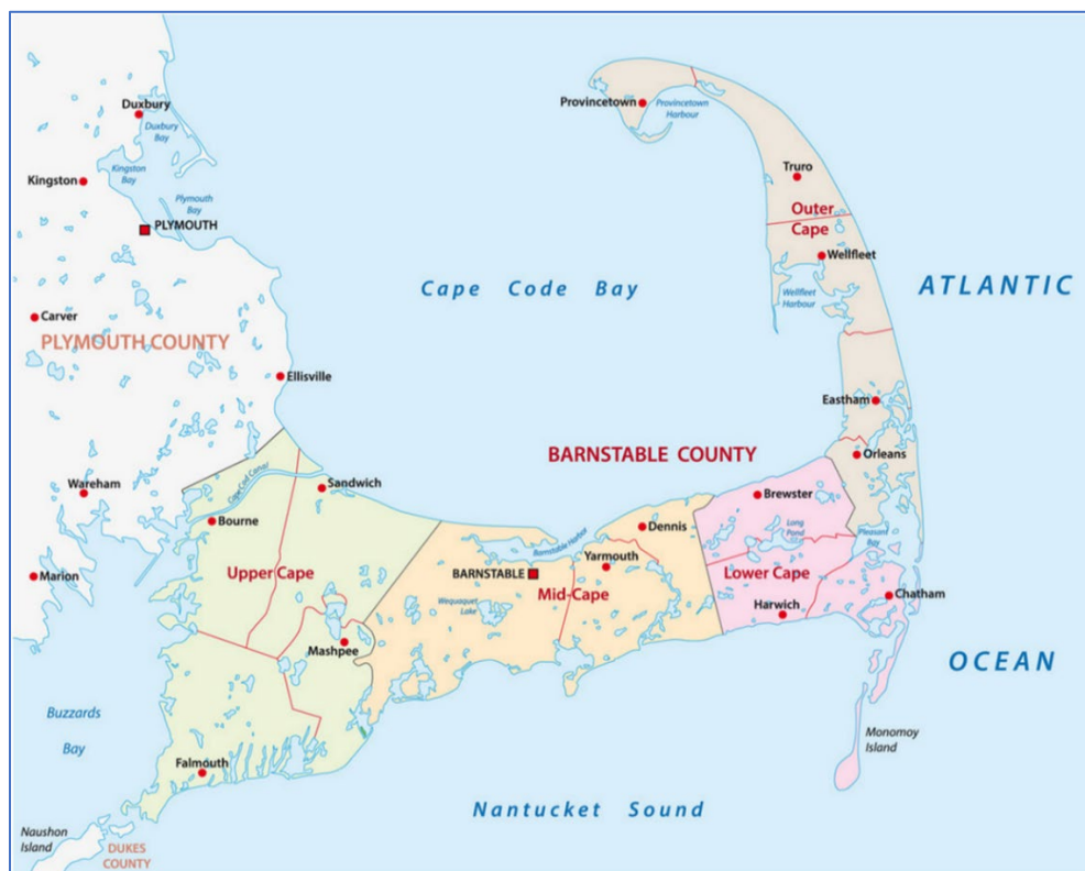
Figure 3-1: Sub-regions within Barnstable County

Rather than constructing a single, large SSO processing facility to serve all of Barnstable County, a decentralized approach is recommended in which multiple, small facilities are developed. Based on a decentralized approach, Geosyntec looked at developing three small-scale facilities across Barnstable County by grouping the 15 towns into three sub-regions (i.e., Outer/Lower Cape, Mid-Cape, and Upper Cape) as shown in Figure 3-1 below.