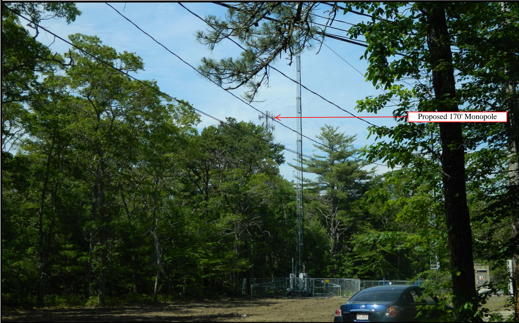
Proposed 170' Monopole