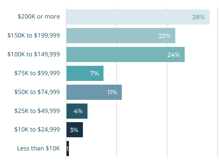
Figure 4: Households per income bracket in Sandwich