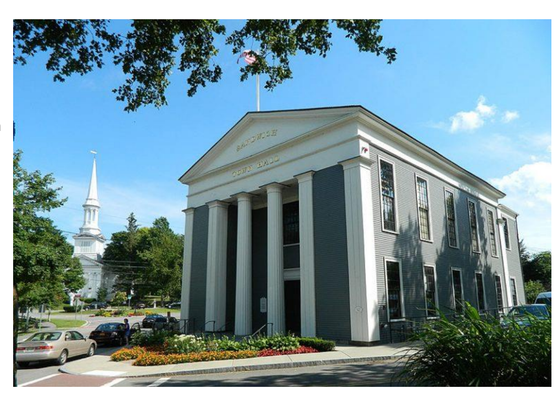
Figure 1: Sandwich Town Hall

The Cape Cod Commission was pleased to partner with the Town of Sandwich in the development of this municipal digital equity plan and looks forward to supporting implementation strategies and opportunities for regional collaboration.