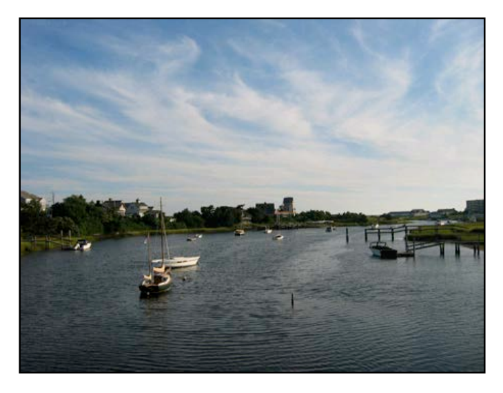
Cape Cod Commission Massachusetts Department of Conservation and Recreation Boston University Preservation Studies Program