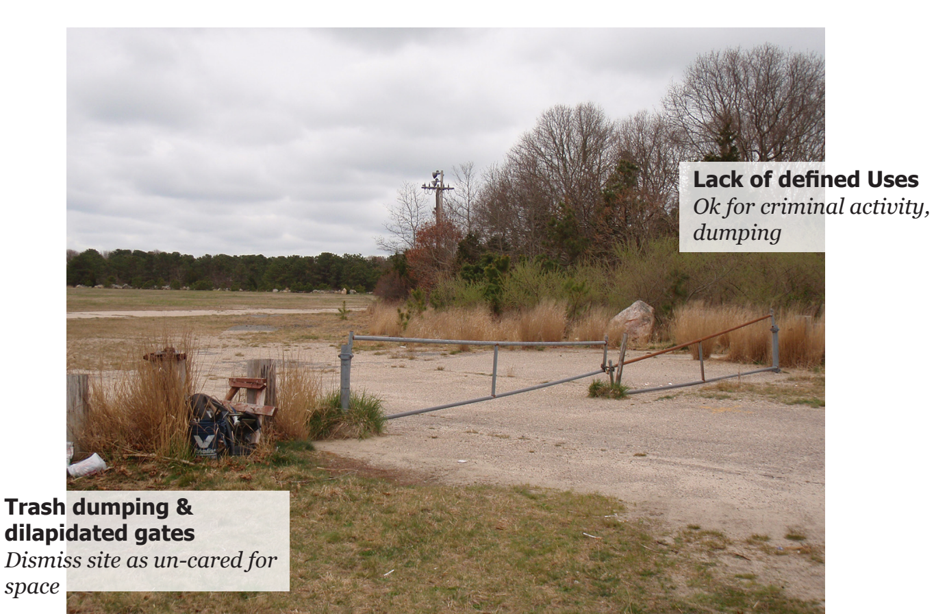
Existing: Drive In Site Entrance