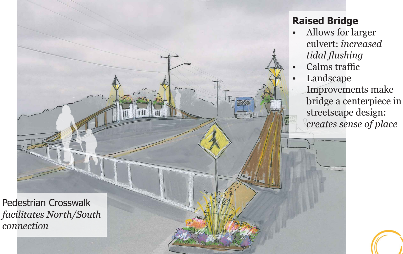
Proposed: Parkers River Bridge Looking East

Existing: Parkers River Bridge Looking East